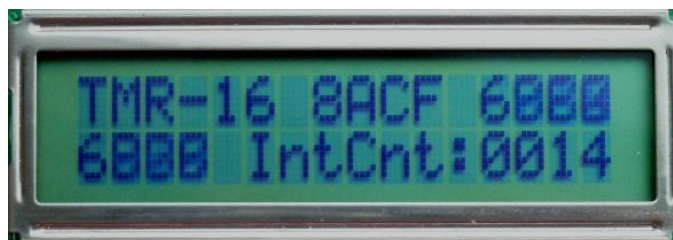
Figure 3. Expected output on LCD